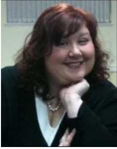
A Message from the President