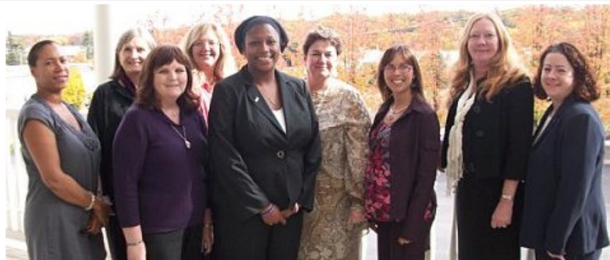
Executive Board Members