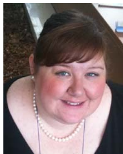
A Message from the President