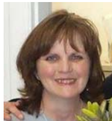
A Message from the President